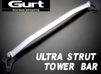
ULTRA STRUT TOWER BAR