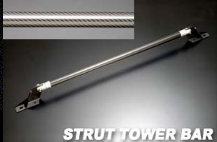
STRUT TOWER BAR